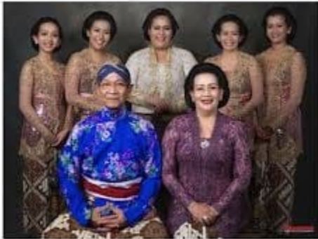
Sultan of Yogyakarta & Family