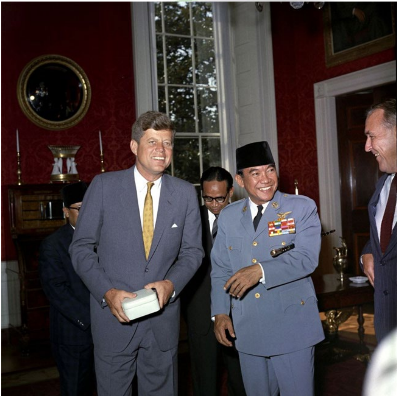
President John F. Kennedy with President Soekarno

It is his story of where he purposely placed his footsteps while trampling on falsehoods and those that perpetrate them. When you finish reading this chronology, you will realize that this one man DID ALL THAT and is still going stronger than before.